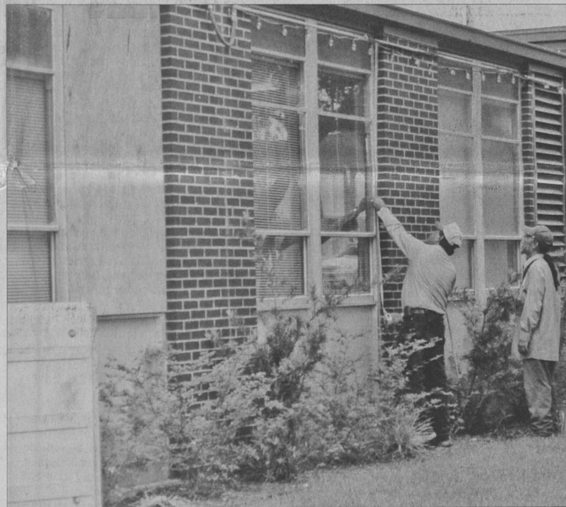
City workers work to board up city hall prior to Hurricane Ike.

Kickoff is set for 7:30 on Friday night in Altair.