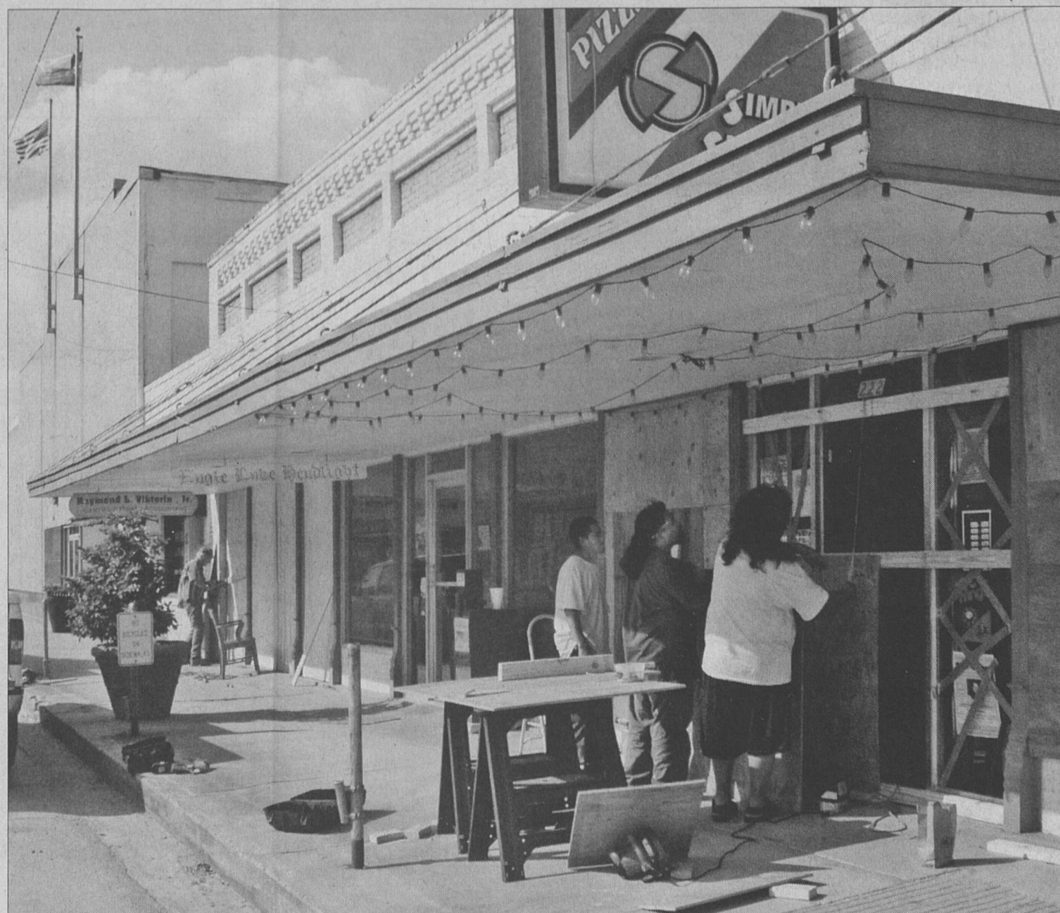
Simple Simon's boarded up in anticipation of Hurricane Ike last week.